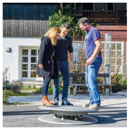
Order No. 9.02652 Sea Roarer free-standing

The gentle sounds of Sea Roarer are best enjoyed in a quiet environment.