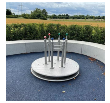
Order No 9.02660 Piper