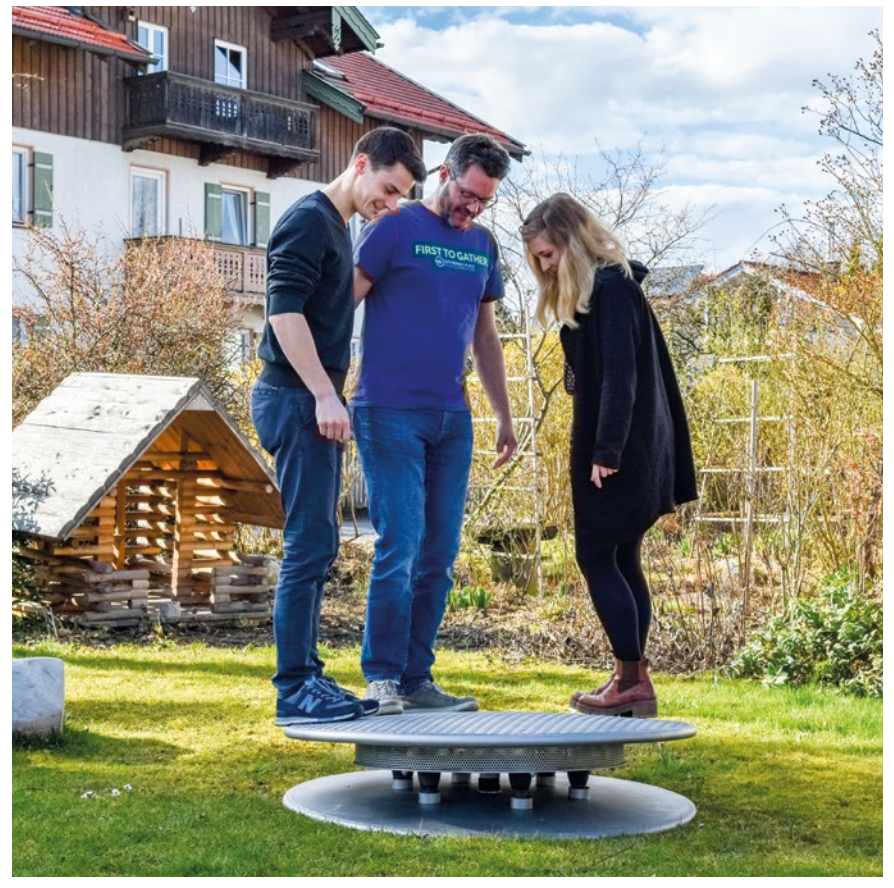
Order No. 9.02650 Sea Roarer