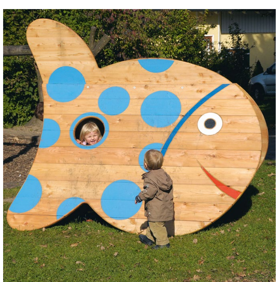
Small Fish with Peepholes, Floor and Bench