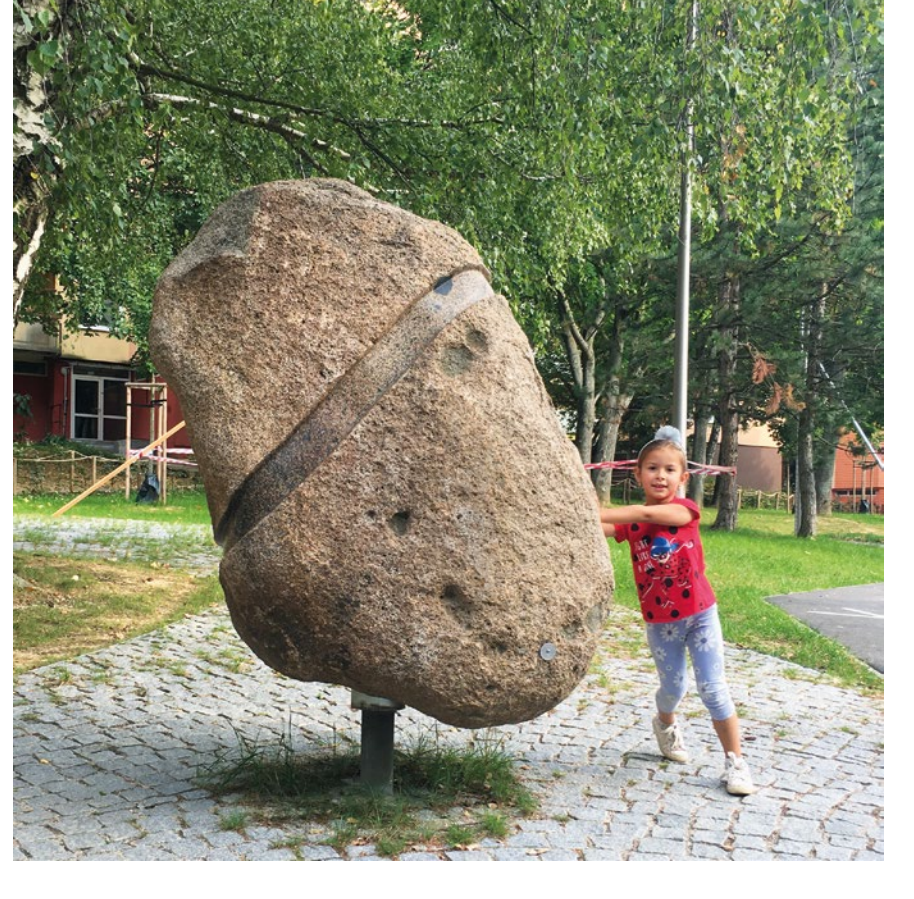
Turning Stone graubner Play Stations for Developing the Senses