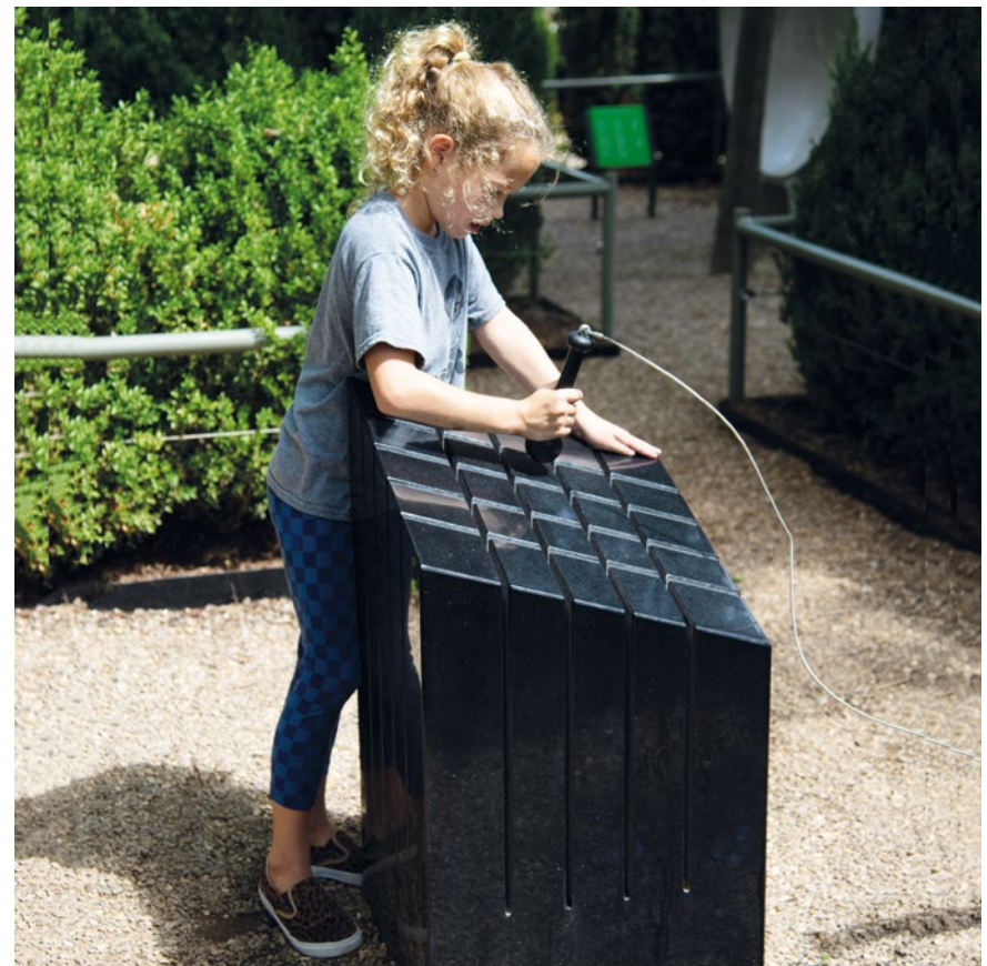
after-school programmes or similar - Public play areas without supervision,

Recommended for - School children - Young people - Adults