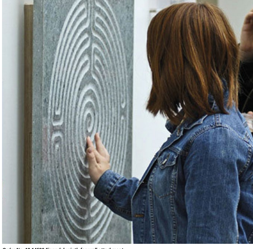
Order No. 10.14500 Fingerlabyrinth for wall attachment