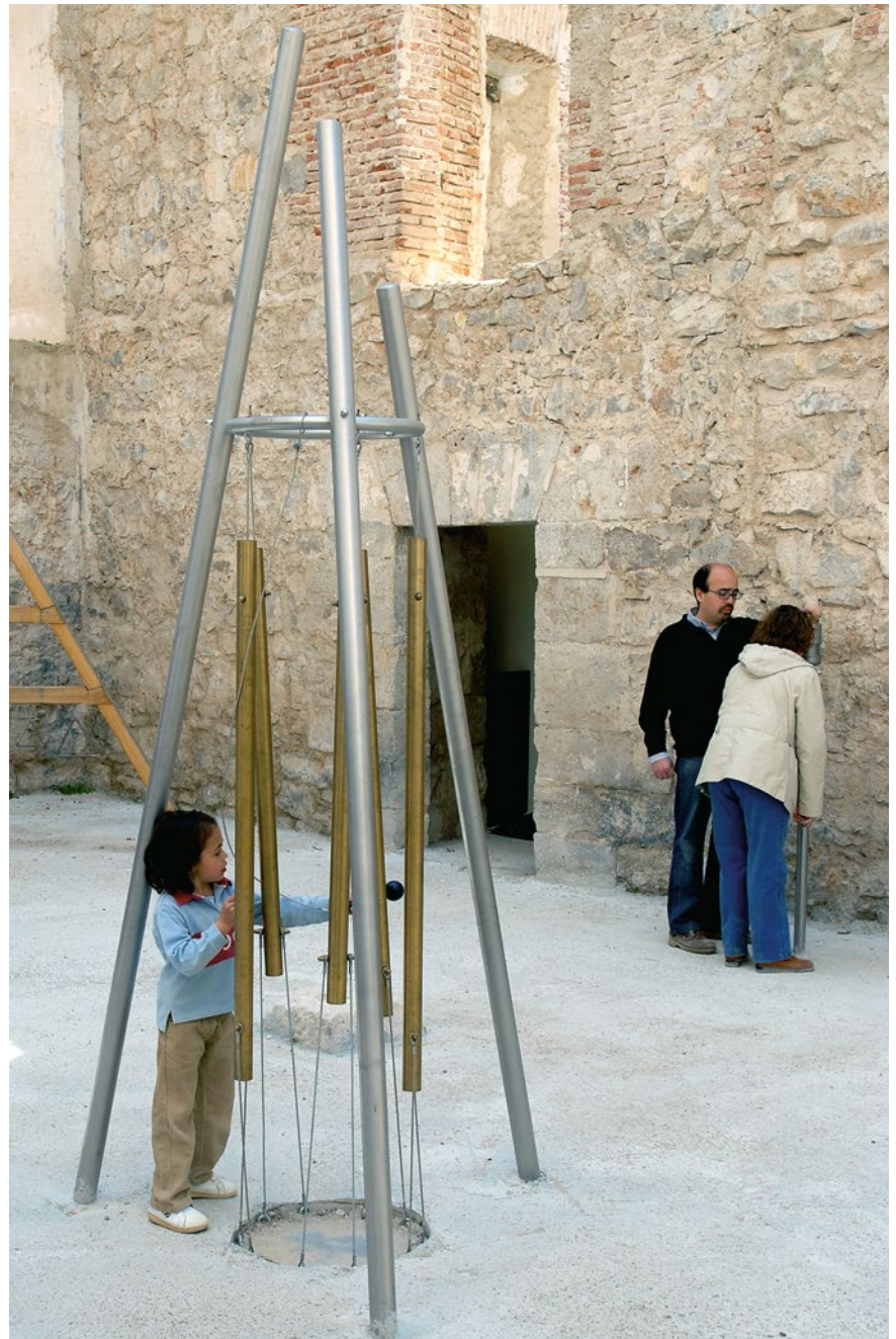
The photos show an outdated attachment of the beaters.